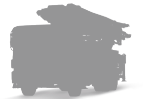
Truck-mounted Concrete Pumps