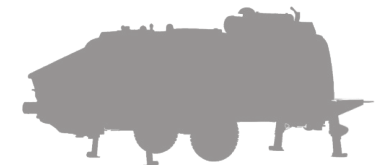
Stationary Concrete Pumps

SANY is the Global leader in concrete machinery manufacturing. SANY offers full range of concrete machinery from concrete batching plants, truck mixers, Stationary Concrete Pumps, Truck-mounted Concrete Pumps, Placing Booms etc. SANY concrete machinery offers reliable performance, wide adaptability, easy operation, high efficiency and lower maintenance cost.