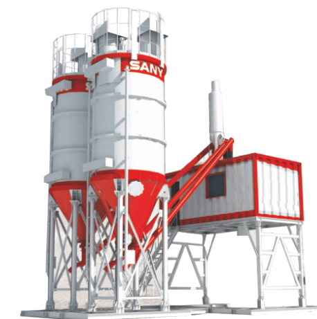
CONCRETE BATCHING PLANTS